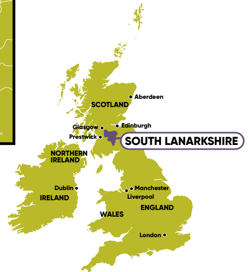
Not to scale. Indicative only. All rights reserved. Ordnance survey Licence number 100020730